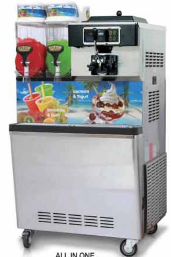
ALL IN ONE